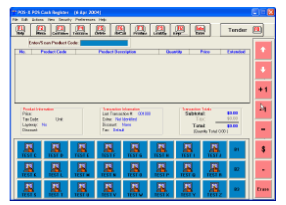
Touch Programmable Menu