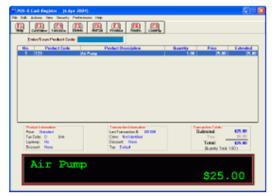
Customer On-Screen Display