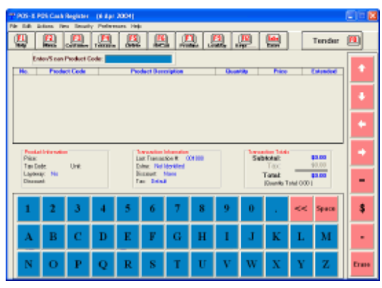
Touch Screen with Letters